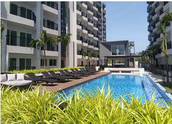
Mantra Condominium, Mae Phim Beach

You are welcome to visit our offices and development on site at Mae Phim Beach, open every day