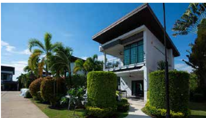
Photo's on actual location residential areas.