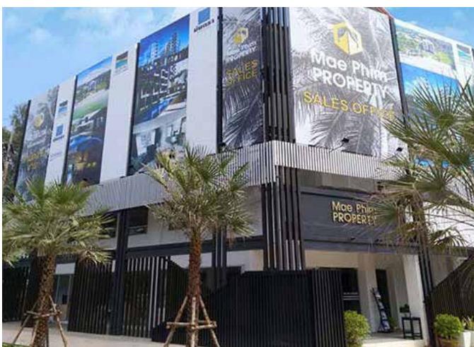
Our Property Sales Office at Mae Phim Beach Road, next to the GrandBlue Resort.