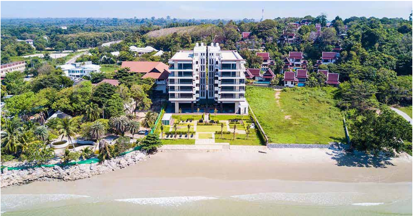
Escape Condominium, Mae Phim Beach, by Mae Phim Property/SilverseaHouse Co. Ltd.