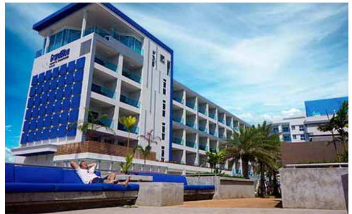
SilverseaHouse Co. Ltd / Mae Phim Property, owner of the GrandBlue Resort